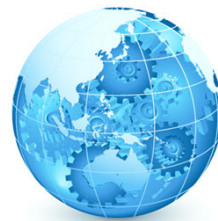
The functionary's view