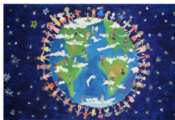
The visionary's view